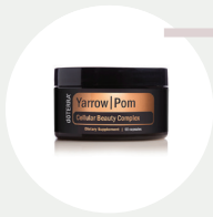
Yarrow | Pom Cellular Beauty Complex