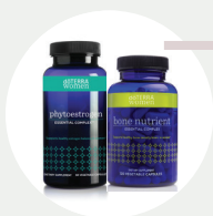
Phytoestrogen & Bone Nutrient