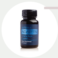
Adaptiv Calming Blend Capsules