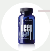
Deep Blue Polyphenol Complex